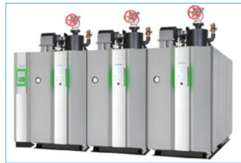
Steam Supply System Combination of BP-201 and SQ-3000/2500/2000AS MIURA Co.,Ltd.