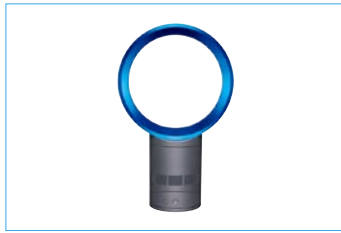
Air Multiplier Air Multiplier AMO1, AMO2, AMO3 Dyson KK