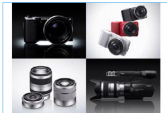
Interchangeable lens digital camera / Interchangeable lens digital HD video camera recorder "alpha" NEX-5 / NEX-3 and "Handycam" NEX-VG10 Sony Corporation