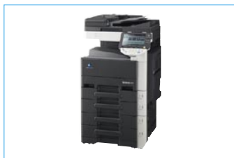
Monochrome Multi Function Product KONICA MINOLTA bizhub 423/363/283/223 Konica Minolta Technology Center, Inc.