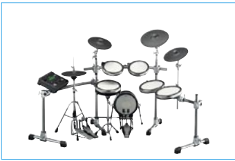
electronic drums DTX950K YAMAHA CORPORATION

* "Good Design Award Best 15" refers to the Good Design Grand Award candidates and Good Design Gold Award winners. When the Good Design Grand Award recipient determines on November 11, the remaining 14 nominees of the Best 15 will be designated as Good Design Gold Award winners.