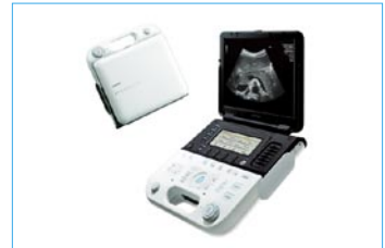
Diagnostic Ultrasound System FAZONE CB FUJIFILM Corporation