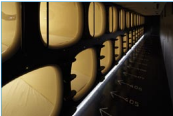
capsule hotel 9h (nine hours) Cubic Corporation