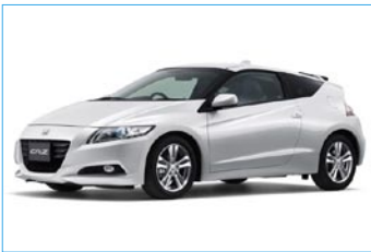
Hybrid vehicle CR-Z Honda Motor Co., Ltd.