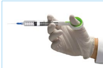
Sonic irrigation system for dentists Vibringe Vibringe BV