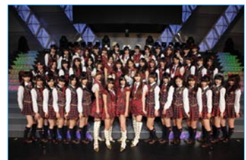
Entertainment Project Design AKB48 AKS