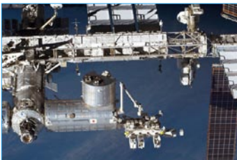
Space Experiment Facility "Kibo" Japanese Experiment Module Japan Aerospace Exploration Agency