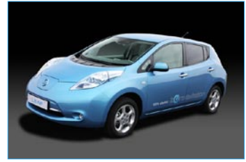
Holistic approach to promote zero-emission vehicle (Nissan LEAF) and zero-emission mobility NISSAN MOTOR CO., LTD.