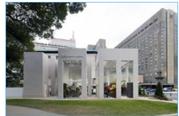
Flower Shop HIBIYA KADAN HIBIYA KADAN