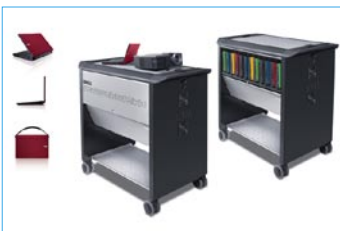
Education Notebook PC Latitude 2100 Experience Design Group, Dell Inc.