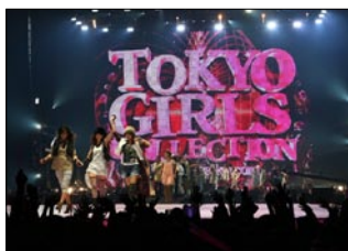
F1 MEDIA Inc.