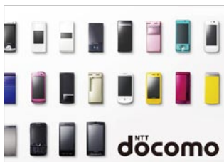
NTT DOCOMO, INC.

Organizer : Japan Industrial Design Promotion Organization (JIDPO)