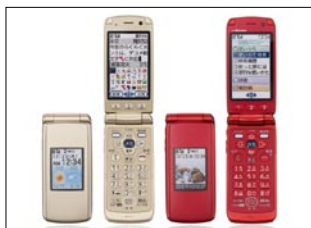
FUJITSU LIMITED/ FUJITSU DESIGN LIMITED