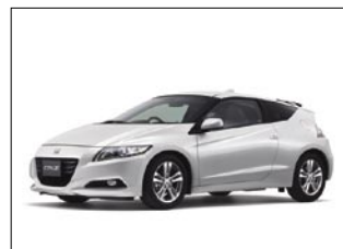
Honda Motor Co., Ltd.