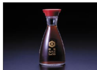
GK Design Group