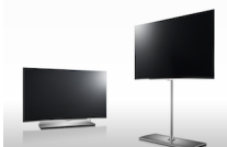
OLED 3D TV [ES9500] /Samsung Electronics Co., Ltd.