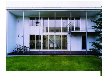
「MUJI HOUSE WOOD HOUSE」 MUJI HOUSE Co.,LTD