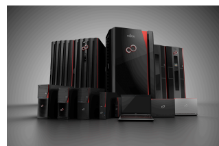
Fujitsu Design Limited

Press contact: Good Design Award Office, Japan Institute of Design Promotion