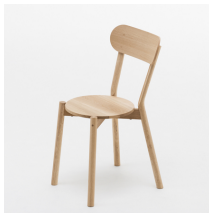
Karimoku Furniture Inc.