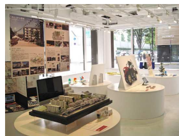
Last year's venue

Dates: Oct. 4 (Wed)–28 (Sat), 11:00 a.m.–8:00 p.m. (open every day)