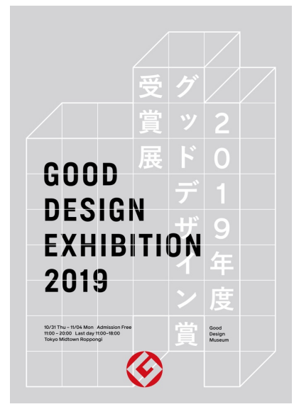
GOOD DESIGN EXHIBITION 2019 (Visual design by Yoshiaki Irobe)

All award winning works (more than 1,000 designs) will be on display at Tokyo Midtown