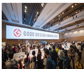
GOOD DESIGN EXHIBITION

All the Good Design Award winning works announced today will be displayed at GOOD DESIGN EXHIBITION 2019 at Tokyo Midtown (in Roppongi) from Thursday October 31. In addition, some will be showcased at "My Favorite Design 2019" held at Tokyo Midtown Design Hub starting Wednesday, October 3 to display the creations selected by this year's panel of 92 judges.