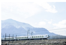
Limited Express [Laview]