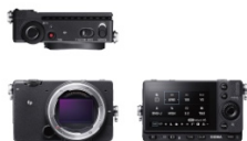
Interchangeable Lens Mirrorless Camera [SIGMA fp]