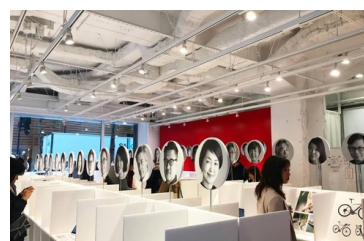
My Favorite Design