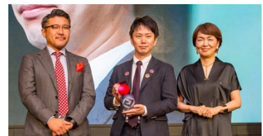
The Good Design Grand Award 2019 winner was Diagnostic Kit