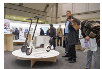
NIKKEI MESSE trade show

The announcement of award winners will be followed by a variety of promotional events, including the GOOD DESIGN EXHIBITION (held at Tokyo Midtown), the GOOD DESIGN AWARD ceremony, and the publication of a GOOD DESIGN yearbook in March of the following year. Award recipients will also be exhibited at trade shows and sales plans, while the Japan Institute of Design Promotion will work with winners to implement various programs at locations including the GOOD DESIGN Marunouchi showroom, and GOOD DESIGN STORES, which serve as our bases of marketing and communications in several locations around the world.