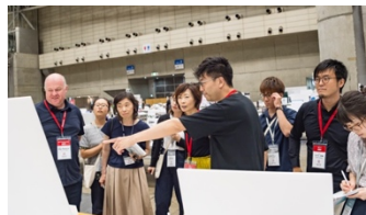
Second Screening Panel, Good Design Award 2019