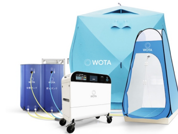
Good Design Award 2020 Grand Award Winner Water Upcycling System [WOTA BOX]

This award will be presented to the most outstanding design chosen from among all recipients of the Good Design Award 2021. Since its inception in 1980, this accolade has marked numerous key milestones in Japanese society through designs that symbolize the times.