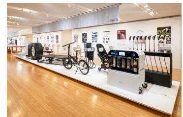
Good Design Best100 exhibition

The announcement of award winners will be followed by a variety of promotional events, including, the Good Design Award online ceremony, and the publication of a Good Design yearbook in March of the following year. Award recipients will also have opportunities to be exhibited at trade shows and sales plans, while the Japan Institute of Design Promotion will work with winners to implement various programs at locations including the Good Design Marunouchi showroom, and Good Design Stores.