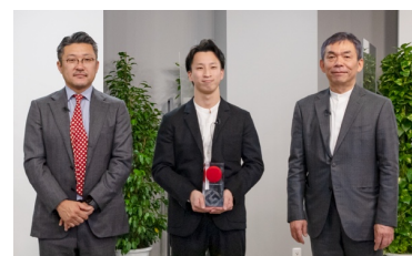
Grand Award winner and Chair, Vice Chair at online ceremony