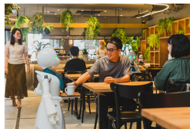
GOOD DESIGN GRAND AWARD 2021: Avatar Robot Cafe and Avatar robot OriHime